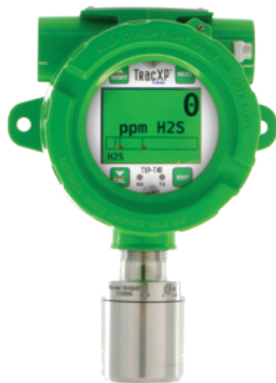
TXP-T40 Aluminum Housing