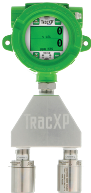
TXP-T40 Aluminum Dual Sensor

The TracXP T40 transmitter is a highly configurable fixed gas detector supporting single or dual sensor applications in Class 1 Division 1 or Class 1 Division 2 environments. Local and remote sensor options allow the T40 to adapt to a wide variety of industrial applications. TracXP intelligent sensors simplify sensor installation and configuration by transferring sensor information to the transmitter including sensor type, measurement range, calibration span values, last calibration date, serial number, and manufacture date. A vivid status indicating color display and LED notification provide superior visual verification of safe or unsafe conditions. Intuitive non-intrusive magnetic interface and embedded webpage make setting up and programming easy. Aluminum, Non-metallic (Poly), and Stainless-Steel enclosures provide alternatives to meet a wide variety of application and cost requirements.