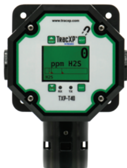
TXP-T40 Poly Housing